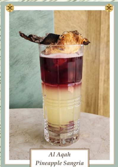
Al Aqah Pineapple Sangria