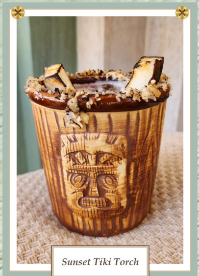
Sunset Tiki Torch