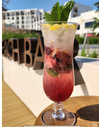
Blueberry Citrus Splash