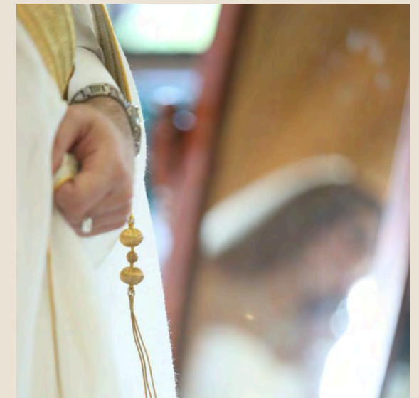
Ethereal Emirati Weddings