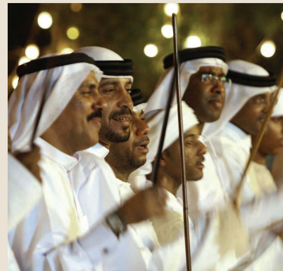
Radwa Origin: Saudi Arabia

This event usually occurs one or two days before the wedding day. It is a small gathering of close male relatives on both sides of the bride and groom. In this exchange, the men on the groom’s side make sure that the bride’s family is satisfied with the party.