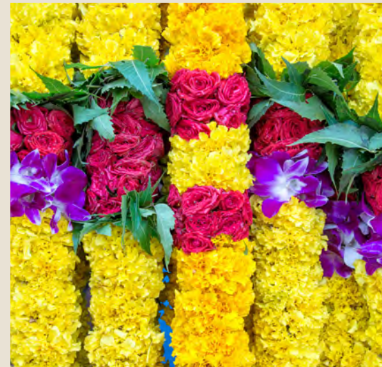
Jai Mala Origin: India

An integral part of the Indian wedding ceremony, this is the part where the bride and groom exchange floral garlands. This expresses the desire of the couple to marry each other. This is the Indian equivalent of the ring ceremony, common to the West.