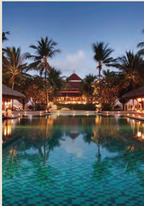
InterContinental Bali Resort