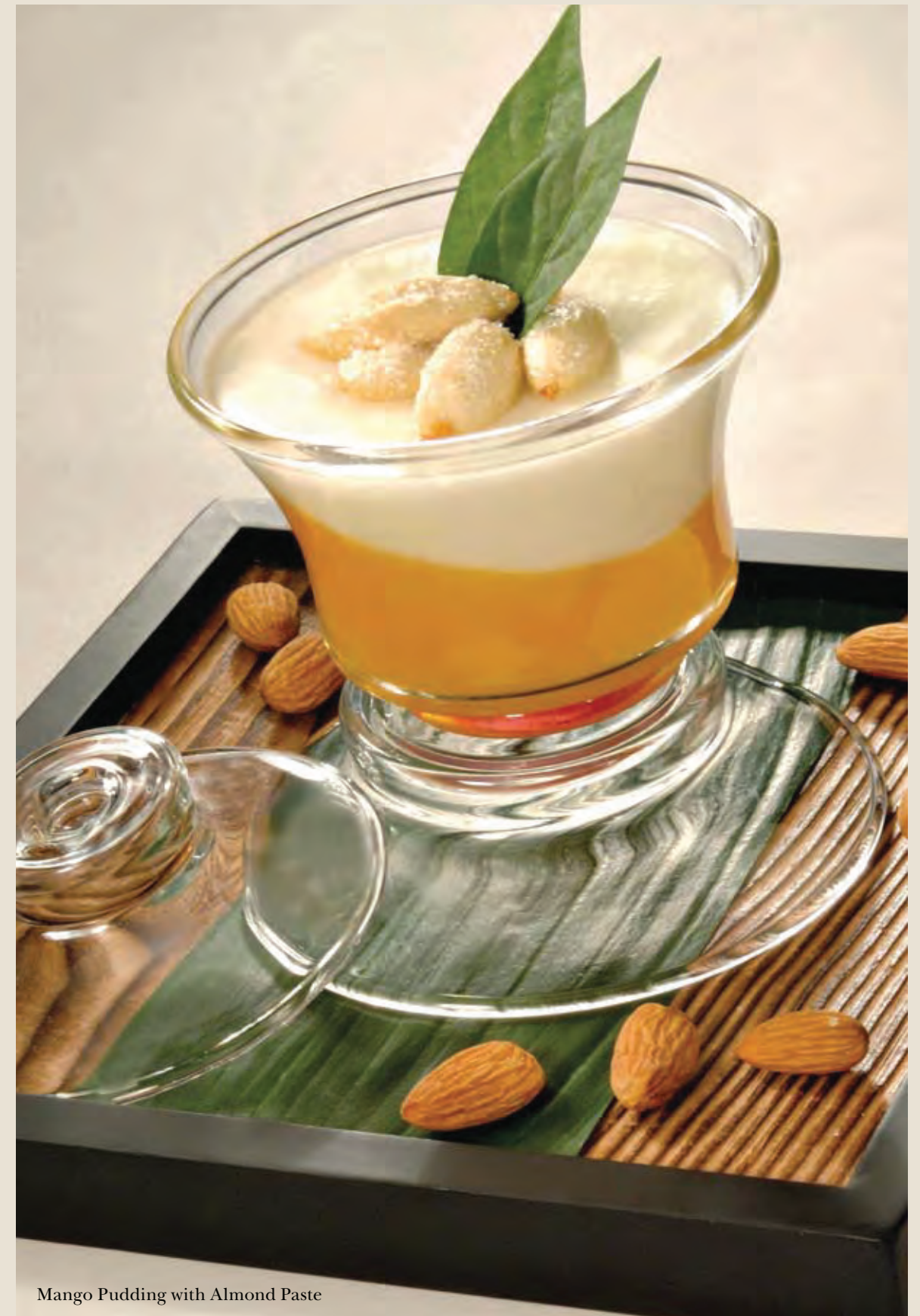
Mango Pudding with Almond Paste