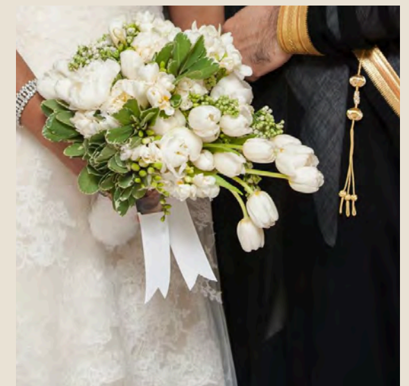
Celestial Arabic Weddings