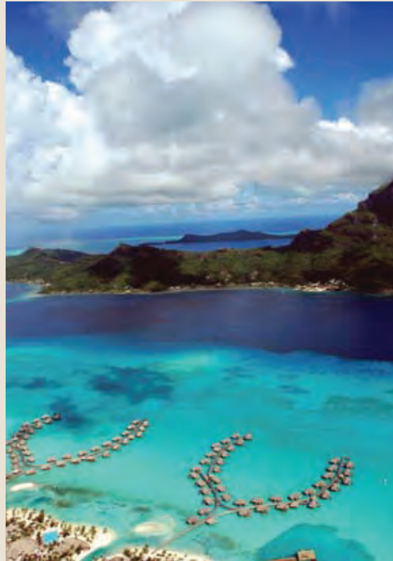
InterContinental Bora Bora Resort & Thalasso Spa

Don't forget to ask our wedding managers for special rates. You can view our hotels at: www.intercontinental.com